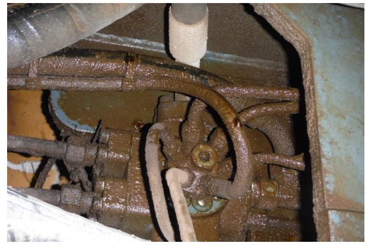
Leaking swivel joint from underside

If support with inspections for used excavators or other heavy machinery is required feel free to contact qualified used machine inspectors. For Europe & Middle East this service is offered by MEVAS, <a href="https://www.mevas.eu">www.mevas.eu</a>. Within the US the team of Honestinspections <a href="https://www.honestinspections.com">www.honestinspections.com</a> can probably help.