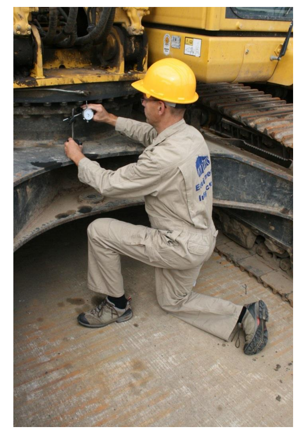
Engineer measuring play in swing bearing

Qualified used machine inspectors know how to measure the play in a slew ring. Just moving the machine up and down with the arm is not very clever as vertical play may look like horizontal play. It is required using a dial gauge and the inspector need to follow a specific procedure.